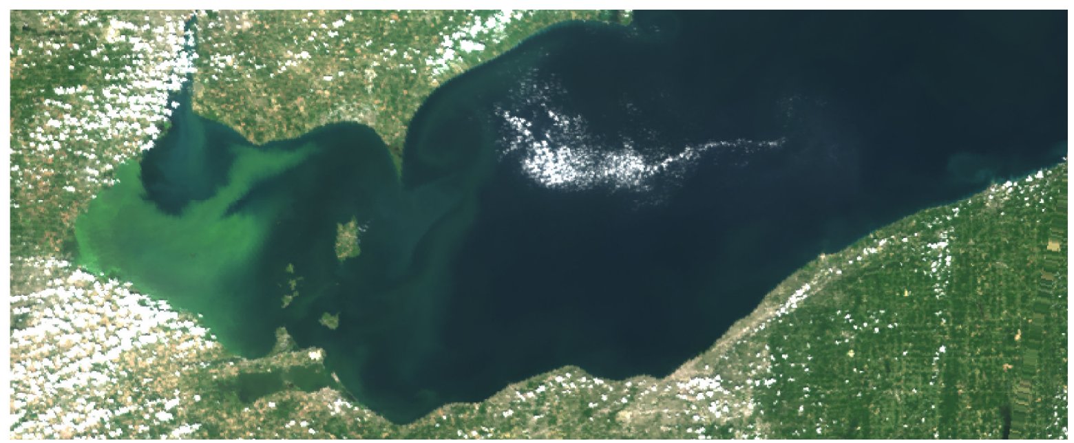
Figure 3. The Microcystis cyanobacteria bloom in western Lake Erie on 05 August 2019 taken with data derived from Copernicus Sentinel-3 data provided by EUMETSAT. This date captures the the maximum biomass of the bloom. The greenish area along southwest Lake Erie and northeastward toward Canada is the bloom. Sandusky Bay has a bloom of Plantothrix , another cyanobacteria, which produced a darker brownish green at this time.

For more information and to subscribe to this bulletin, go to: http://coastalscience.noaa.gov/research/habs/forecasting